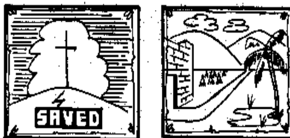
“The Magic Square”