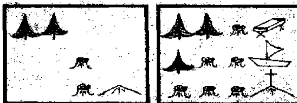
“The Three Trees”

For further information and planned Seminar schedules contact: